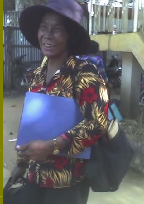
A commune councilor member returning to her community.