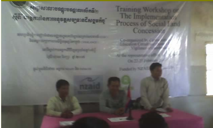
The panel distributing certificates at the closing ceremony of the 2 nd Training Workshop.

Funded by: NZAID and Oxfam GB Prepared by: Kit Touch, Program Officer 12 March 2007