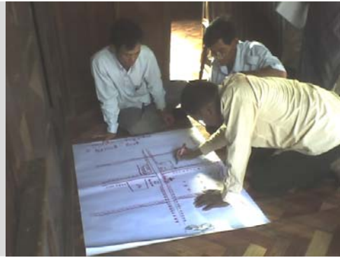
Community urban planning of group discussion ...

As planned by trainers working group of CLEC and Vigilance, the first day of the workshop was a review session to ensure trainees had a comprehensive knowledge of the SLC mechanism. Their understanding would lead them into action for what followed (one of expected outputs).